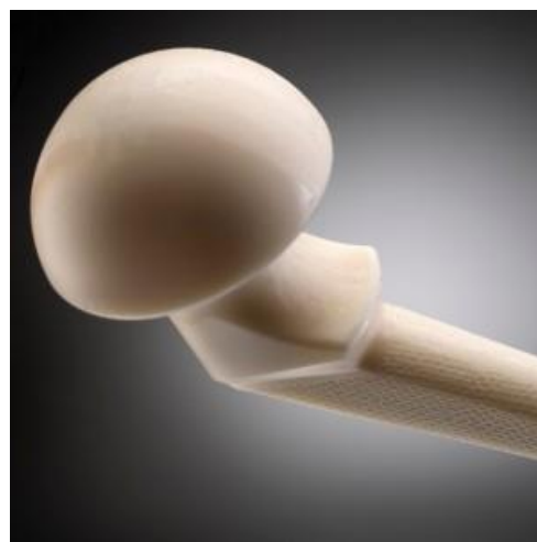
SPACER G FLAT STEM - short stem

Available in 3 sizes of head: 46/54/60 mm