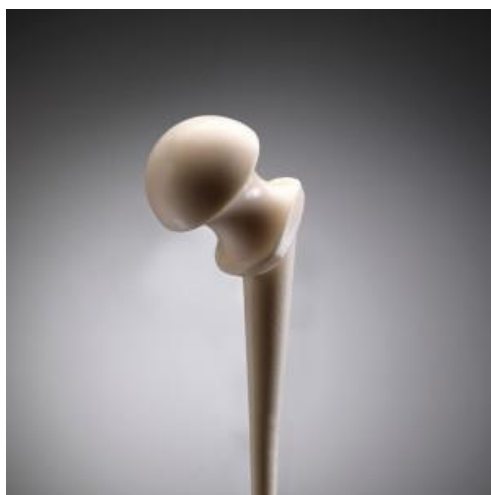
SPACER G - long stem

Available in 3 sizes of head: 46/54/60 mm