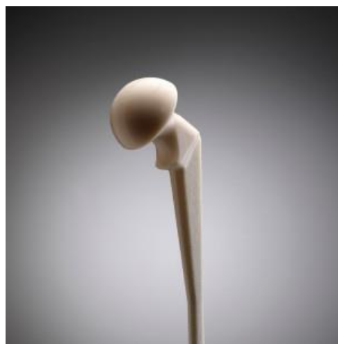
SPACER G FLAT STEM - long stem

Available in 3 sizes of head: 46/54/60 mm